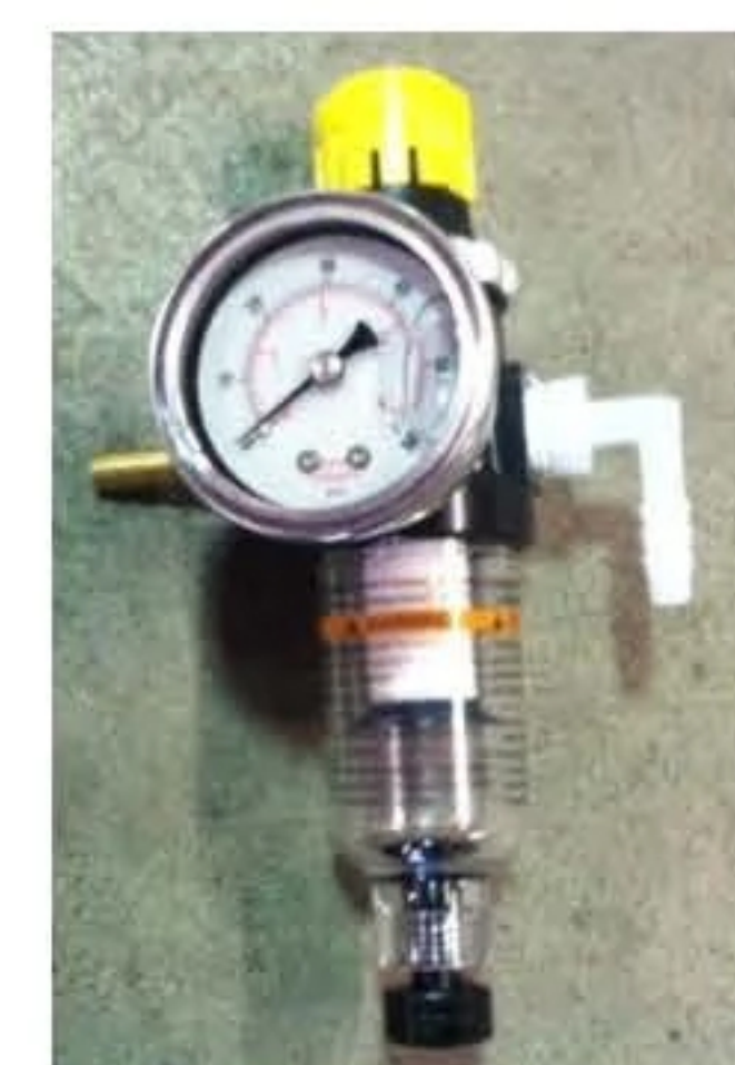
← FM3300 FM3300-LM (use this number to include a stainless bracket not shown)